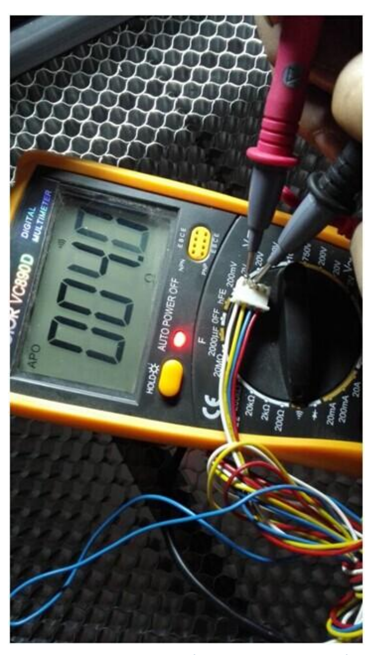
2 connected two groups cables of stepper motor with the left driver board. In left drive board has two thick cables like attached 1, please connected two groups cables with A+ A- and B+ B- in left